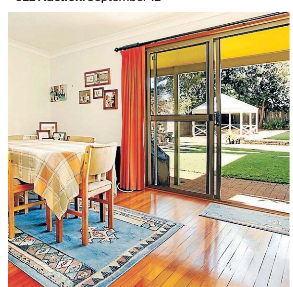
Cammeray 1/27a Lytton Street $650.000+

schools, the station and the M7. It has a gazebo, a garage and workshop, and there's potential to convert a garage into a granny flat if the council agrees. Inspect: Sat, noon-12.30pm Agent: Harcourts Unlimited, 0424 663 522 Auction: September 12